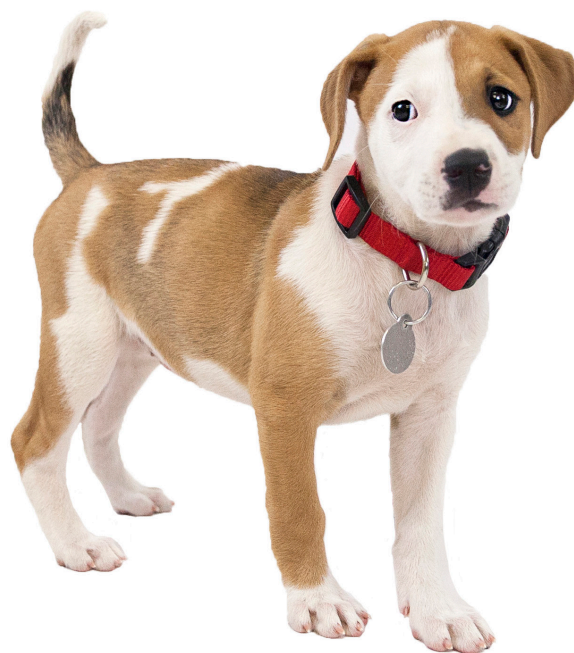
Stevie Licks, rescued & adopted in 2018

All proceeds from raffle and silent auction packages will directly benefit Berkeley Humane, thanks to generous donations from businesses like yours.