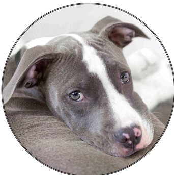
Inside: In a Fight for Life