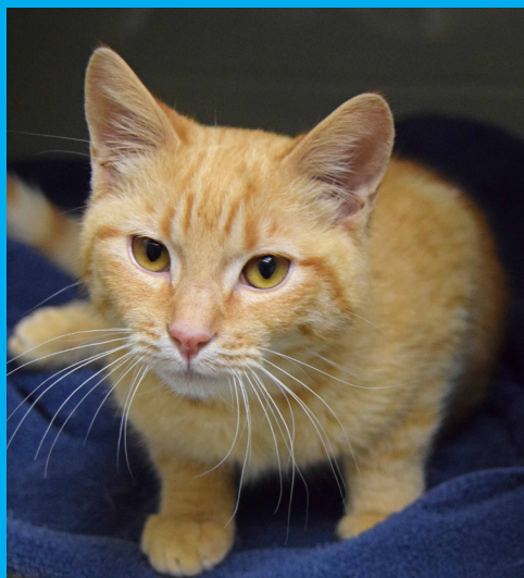
Tagalong needed surgery to help him run and play free from pain.