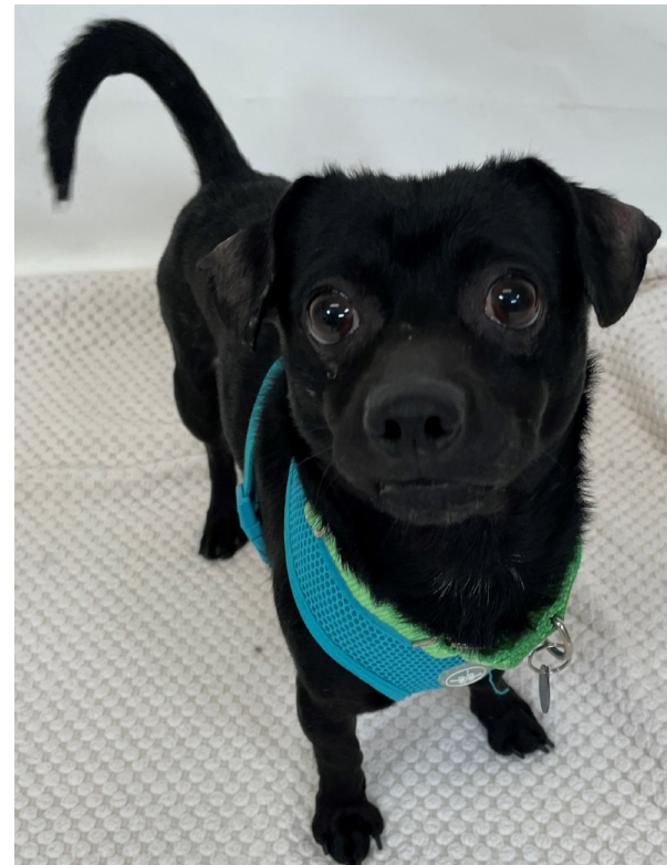
Ripley: Ready to start a new, safer and healthier life

After receiving a thorough medical examination we began a treatment of antibiotics, prescription food, and medicated shampoo to help relieve his pain.