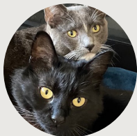
NOKHOD & FISTIK

"They bring our family lots of joy with their antics, cuddles and playfulness."