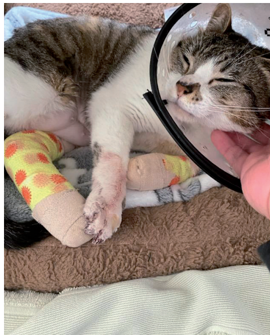
Auryn feeling some love during recovery