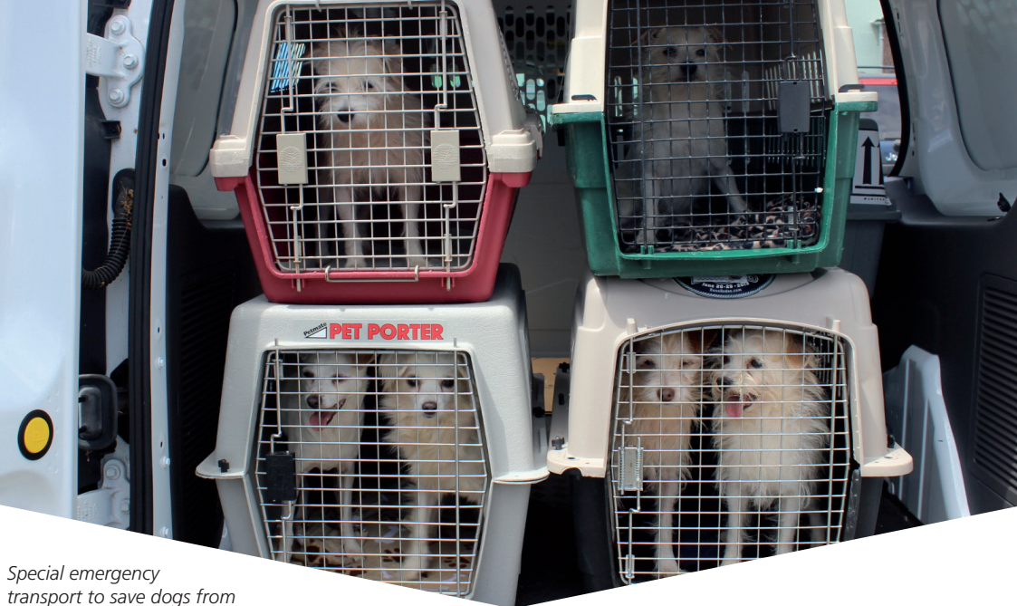
Special emergency transport to save dogs from unsafe home