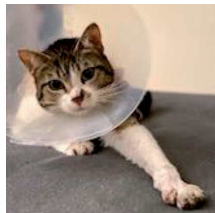
Exciting progress after many weeks of recovery

We are often called upon to care for pets who have experienced abuse and neglect, and as difficult as that can be, we are also privileged to be surrounded by people who provide the care and resources necessary to save pets like Auryn. She's now been adopted and is settling in nicely with her new loving family. Your support for our medical, foster, and adoption programs gave Auryn a new chance in life.